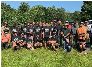
All American Adventure 2019